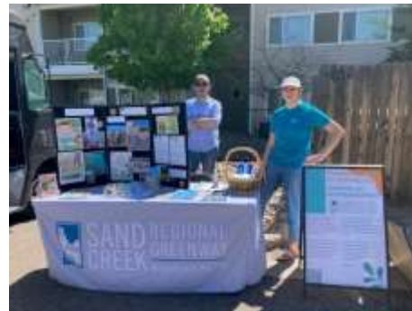
On Saturday May 27, 2023, the Sand Creek Regional Greenway hosted a get together at the museum for the neighborhood to learn about what is happening on the greenway.